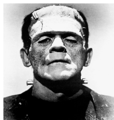
Boris Karloff in Bride of Frankenstein

Although Frank Capra cast Raymond Massey as Jonathan Brewster in the film version of Arsenic and Old Lace (which was shot in 1941, while Karloff was still appearing in the role on Broadway), Karloff reprised the role on television in the anthology series The Best of Broadway (1955), and with Tony Randall and Tom Bosley in a 1962 production on the Hallmark Hall of Fame .