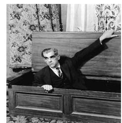
Boris Karloff in Arsenic & Old Lace