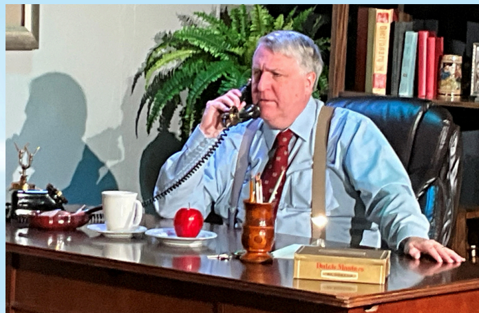
This play was the best one yet!!