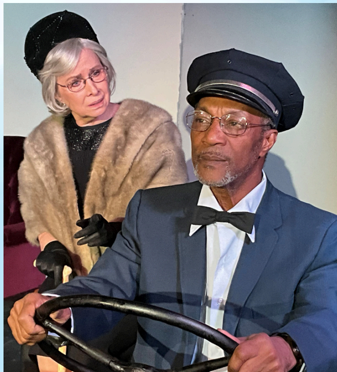
Hoke and Miss Daisy were fantastic! Sure made our day!

A wonderful start to ACT's 50th season of live entertainment in the community!