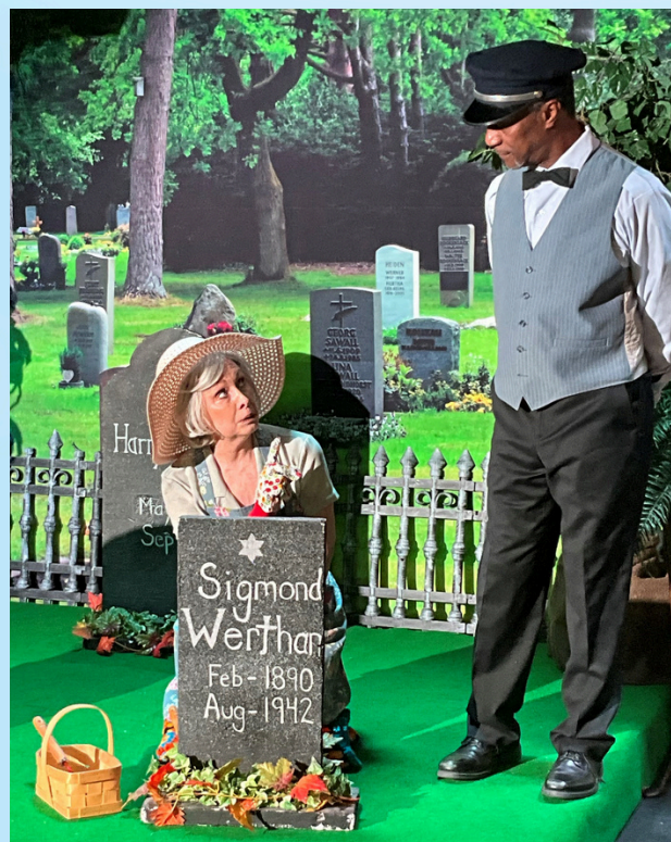
The entire cast was so good! Congratulations on a fabulous show!